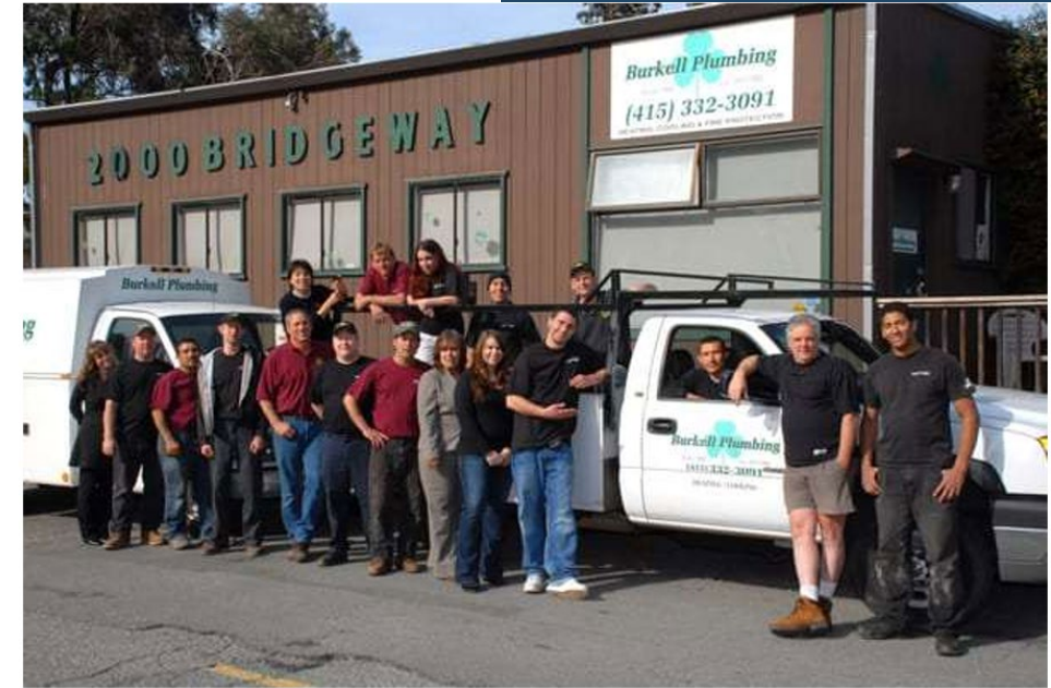
Burkell Plumbing, member of the Marinship Community for over 60 years. At Marin Made, kids are introduced to industrial design and manufacturing